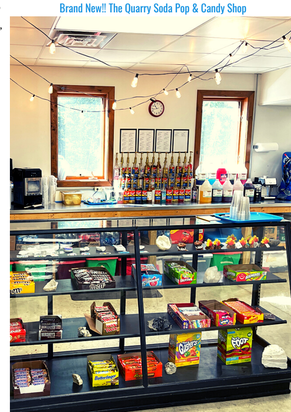
Quote from one of the Teen Campers