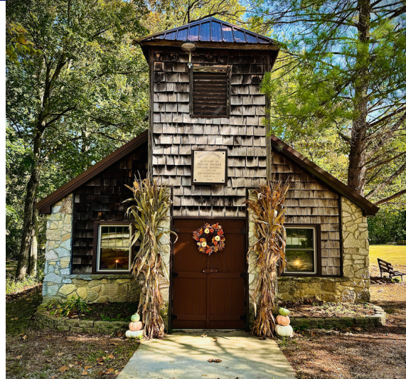
Fall Decor on the Chapel