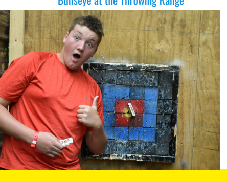
Bullseye at the Throwing Range