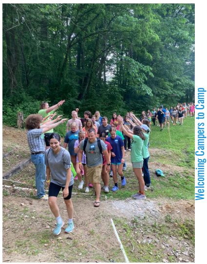
First Meal at Camp: a Picnic!!!