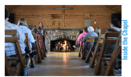
Teaching the Word Growing in Christ Serving His People