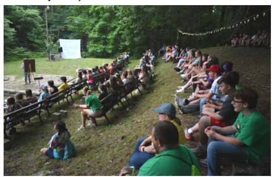
First Night Frivolities at the Vespers Area

"If 'Best Friends Since Sunday' doesn't perfectly describe camp, I don't know what does!"